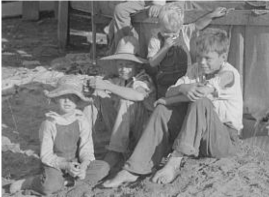
Children of a sharecropper, Manning, SC, 1939.

The Great Depression brought many economic problems to South Carolina in the 1930s. Farm prices were low and many factories, banks, and businesses closed.